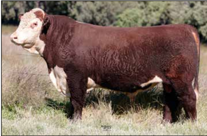
LOT 9 - RAYLEIGH ULTIMATE U15

Purchased for $14,000 by Sam Powell NSW.