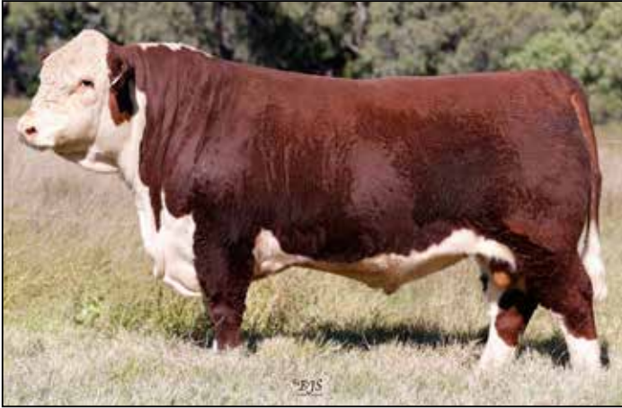
LOT 2 - RAYLEIGH UKRAINE U18

Purchased for $20,000 by G and W Steiner NSW.