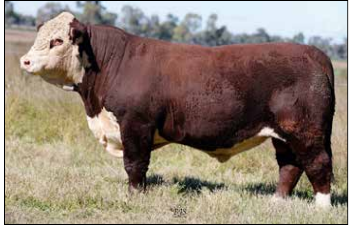
LOT 6 - RAYLEIGH UNION U1