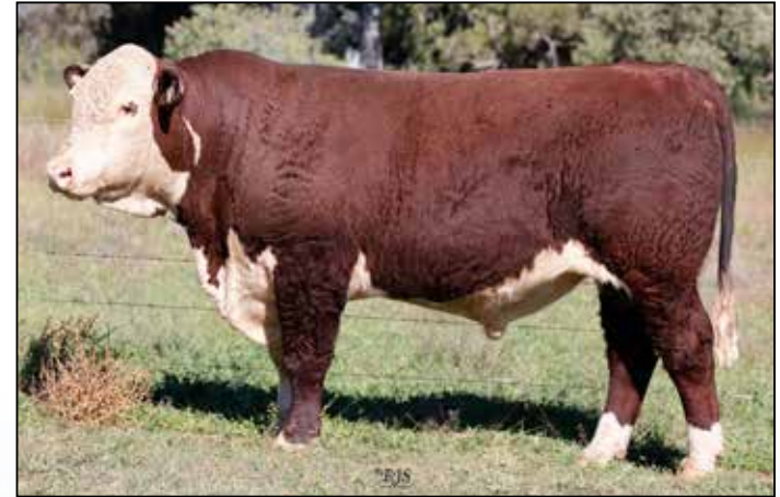
LOT 15 - RAYLEIGH UNCLE U132

Purchased for $14,000 by Michael Nott NSW.